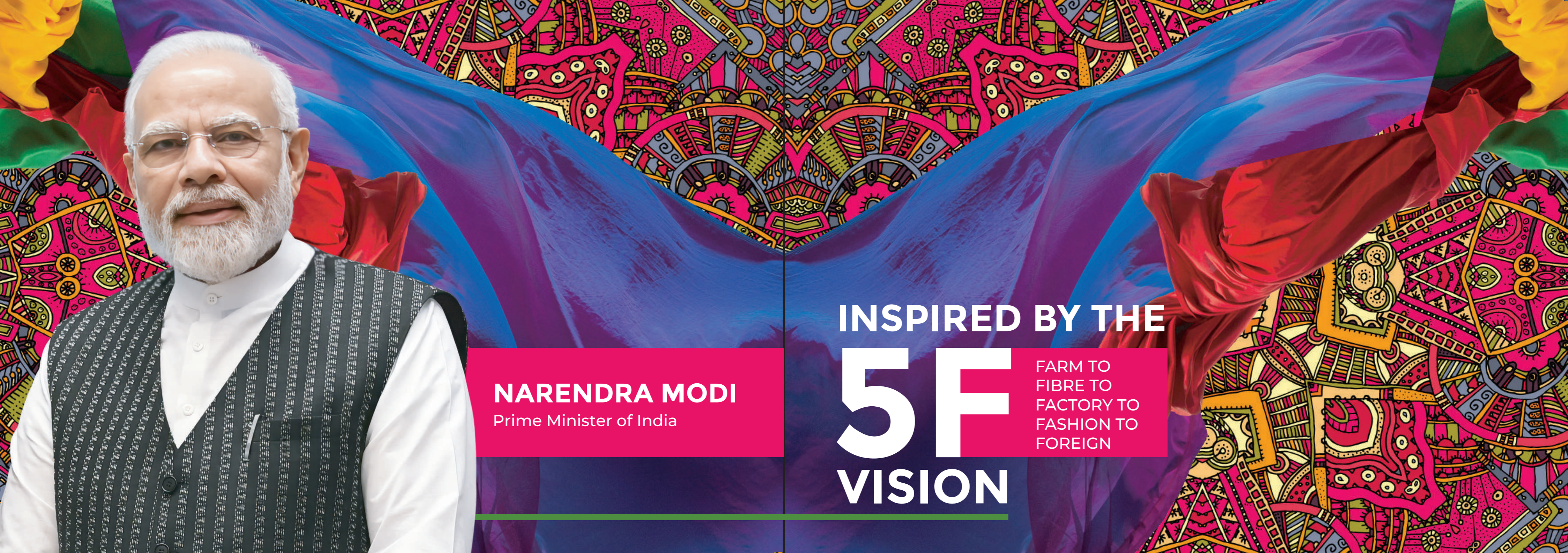
NARENDRA MODI Prime Minister of India