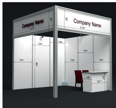
Two Face Open Booth